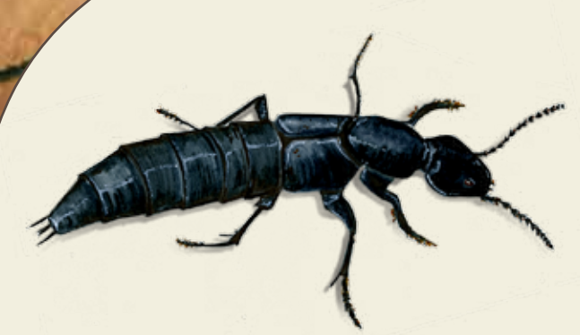
Flightless Rove Beetle