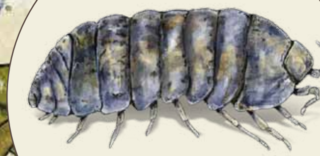
Beach Pill Bug